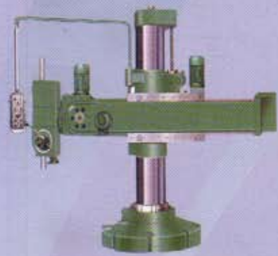
Universal Radial Drilling Machine Model SRD - 40AS