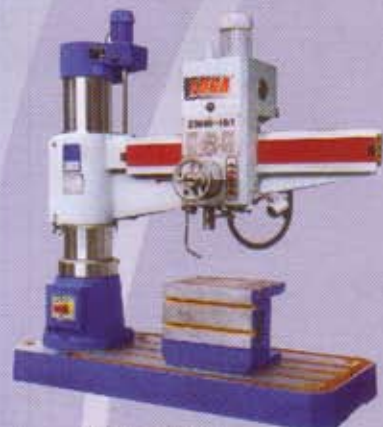
RD - 50W