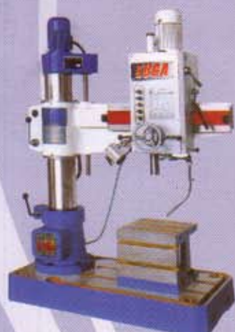
RD - 40W / WE