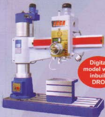
RD - 50WD