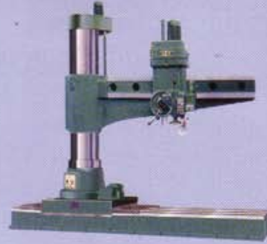
Travelling Type Radial Drilling Machine Model SRD - 100AS / 125AS